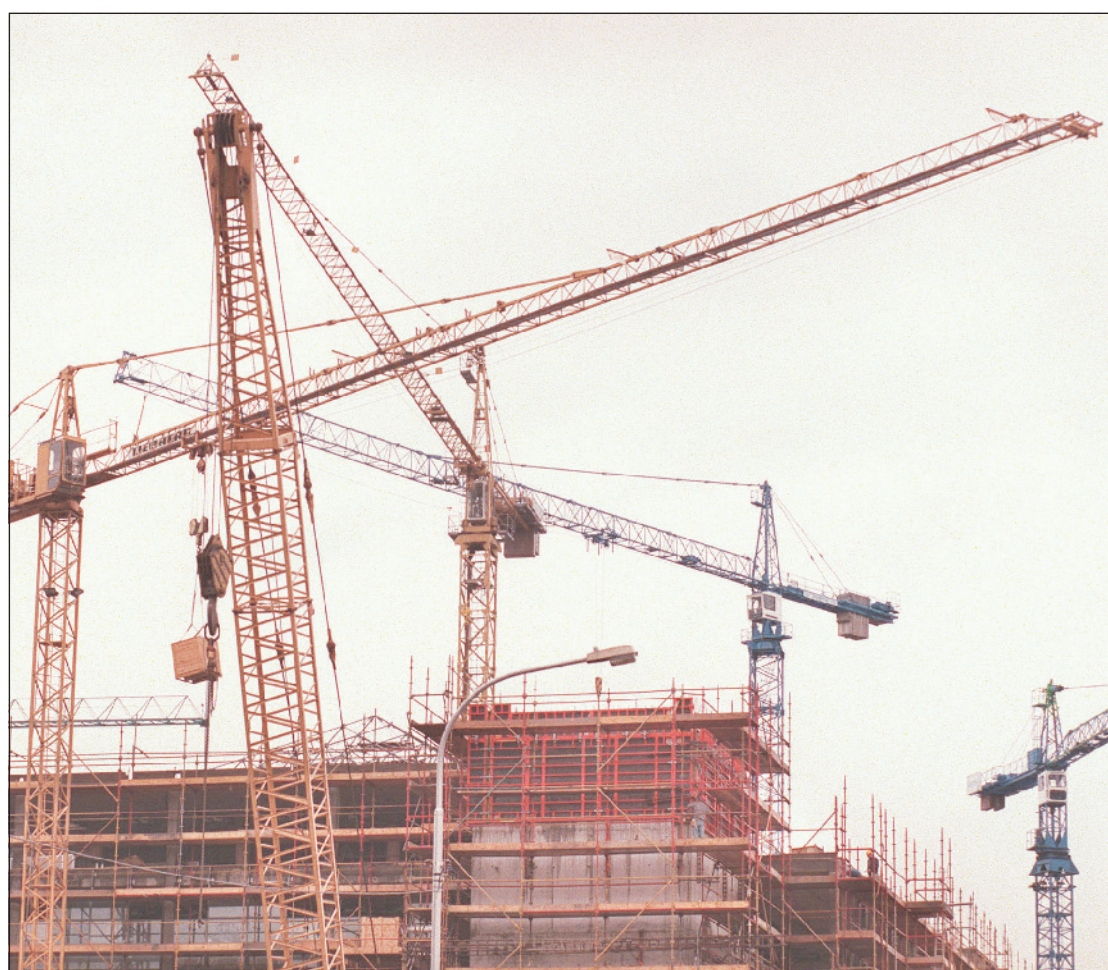
As well as stamp duties and capital gains taxes, income tax returns have depended on employment growth in the construction sector.